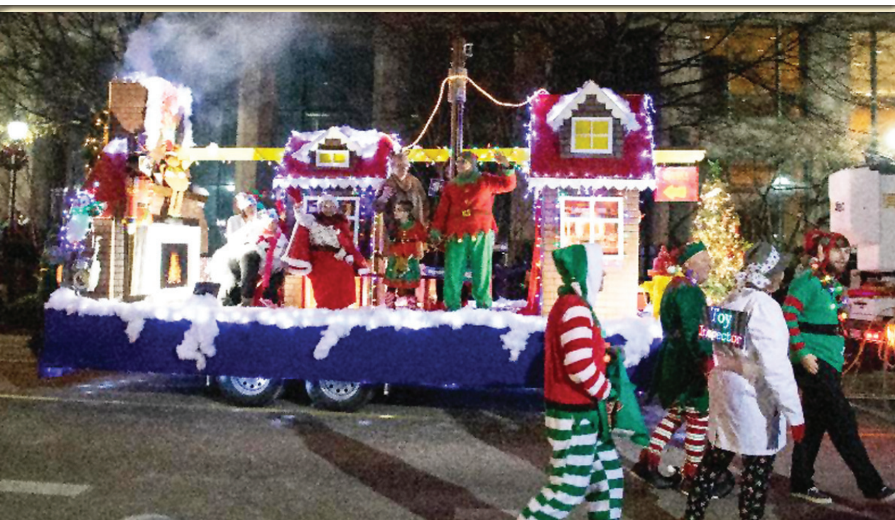
WINNER: Huntsville float wins First Place in Huntsville's Christmas Parade.