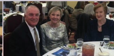
Guests from the United Way