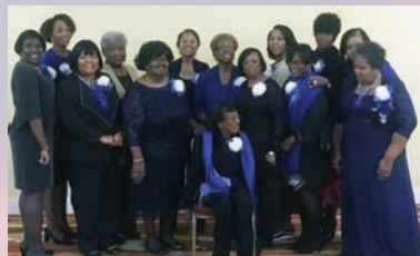
2018 Members of the Society of Professional Women (SOPW)