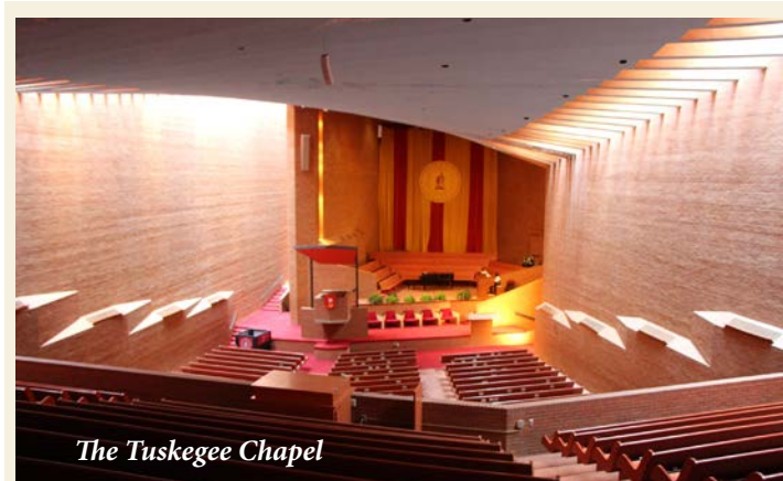
The Tuskegee Chapel

Saturday, June 15 249th U.S. Army Birthday Celebration Redstone Gate 9, 4-9 p.m.